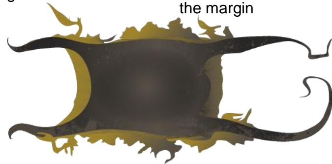
Undulate Ray Capsule length: 7-8cm Small fringe may be present along the margin