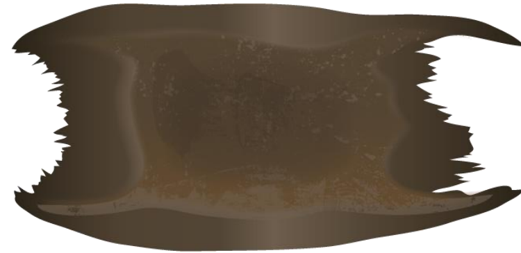
Flapper Skate Capsule length: 15-20cm Covered in dense bark-like substance