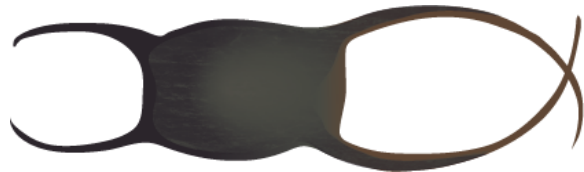
Cuckoo Ray Capsule length: 5-6cm Upper horns are very long and curved (if intact)