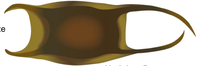
Blonde Ray Capsule length: 10-12cm Horns often broken and confused with Flapper Skate