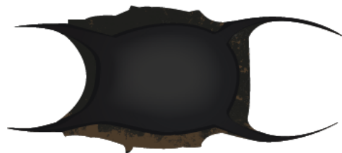
Thornback Ray Capsule length: 6-7cm Can be square or rectangular Well-formed keels and horns