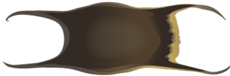
Spotted Ray Capsule length: 5-6cm Often confused with Undulate Ray egg case but has more common distribution